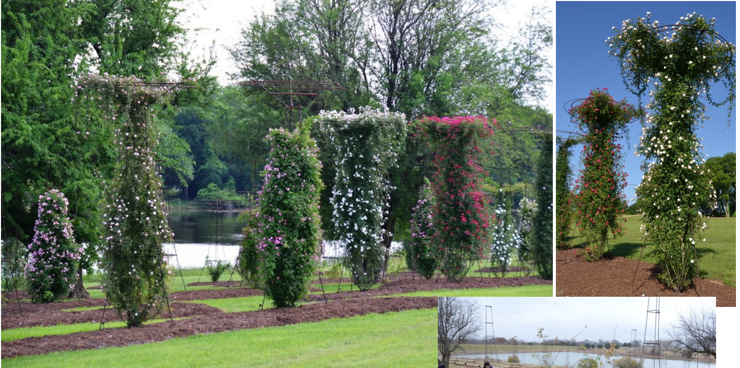
Photo at Right was taken in December, 2013 when the ramblers pictured above were being planted at Chambersville. The Photos above were taken in April of 2015, 17 months later. Ramblers grow fast! Can you say “Jack and the Beanstalk!”

These Ramblers at Chambersville are planted in the same type of bed as designed for the Rambler Pilot Garden at the ARC.