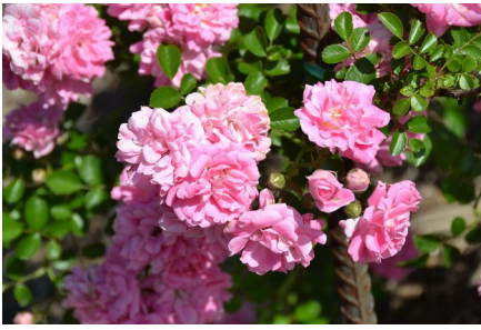
Dorothy Perkins Fades to darker pink