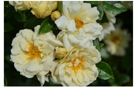
Gardenia Quickly fades to pure white