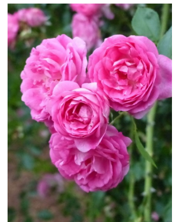
Vicomtesse de Chabannes