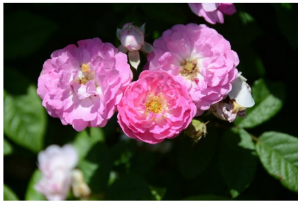
Geschwind's Nordlandrose #2