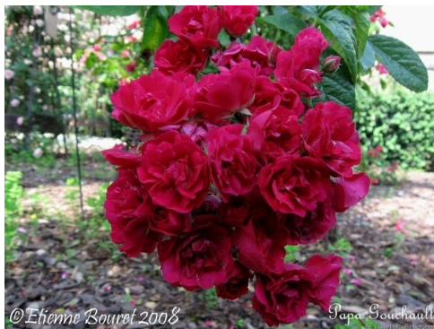
Papa Gouchault