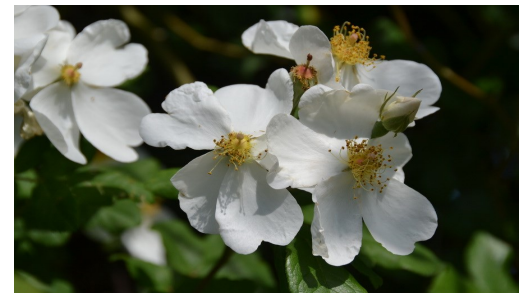
'Evangeline' , Walsh