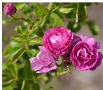
'Rudelsburg' , Kiese