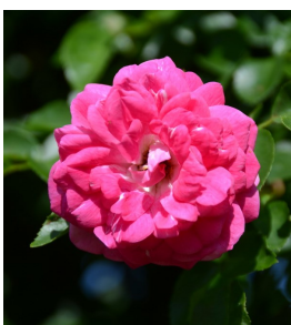
'Ruby Queen' , Van Fleet

Some of the other ramblers for the Pilot Garden are shown below.