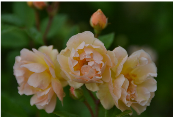
Left Mature blooms age to a soft apricot color