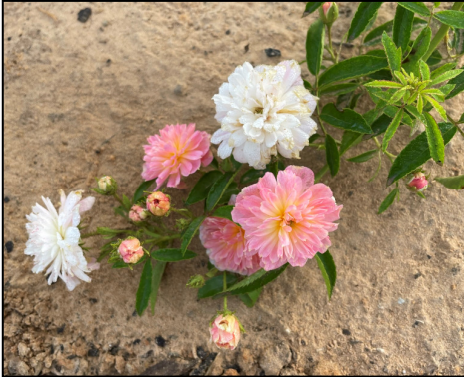
Steven's photo of Gislaine Feuerwerk

The difference in coloration and flower form in my own photos of the same rose in the Gardens at Chambersville over a number of years and taken at different stages of bloom was truly amazing. Below are a number of the photos of Gislaine Feuerwerk taken at Chambersville over the years. These photos dramatically illustrate why it is so difficult to identify a rose from a photograph.