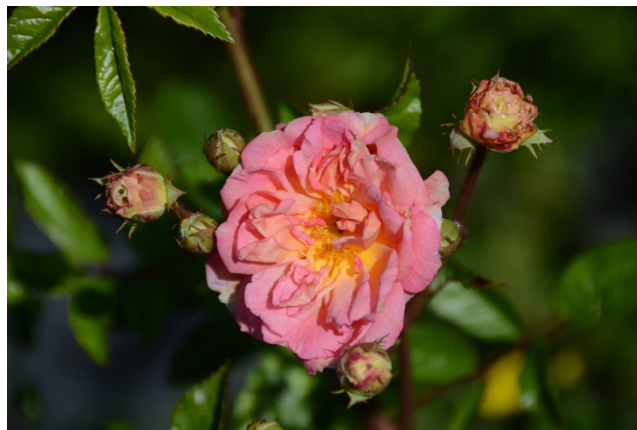
Chambersville photo of Gishlaine Feuerwerk

I searched my own database for photos of 'Gishlaine Feuerwerk' and was amazed at the great differences in the photos for the same rose from year to year and from blooms early and blooms later in the season, and obvious differences indicating if we were having a cool or warm spring that year showing up as deeper of colors in cooler weather. Stevens photo was taken recently (yes, this rambler does rebloom later in the year), my photo was taken on April 27, 2018 when it was much cooler.