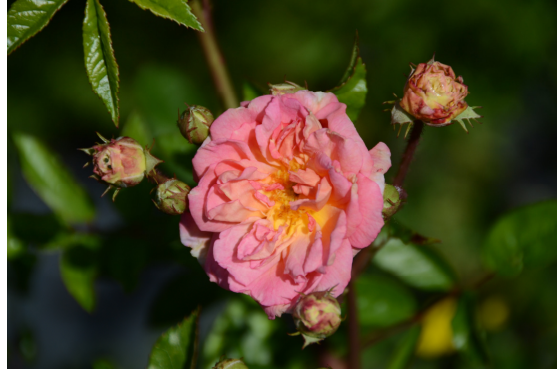
Chambersville photo of Gislaine Feuerwerk