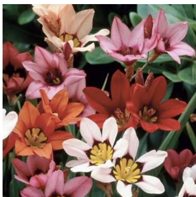
Sparaxis or Wandflower