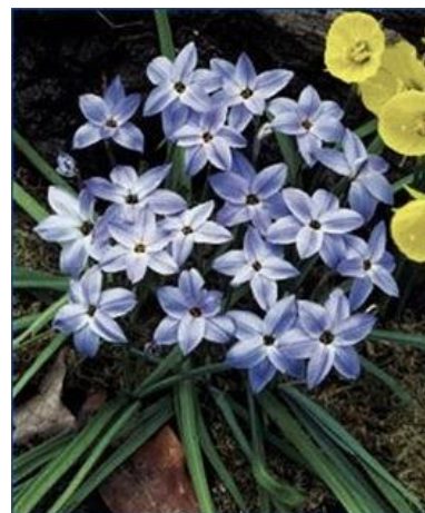
Ipheion Wisley Blue