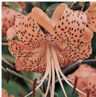
Splendens Tiger Lily