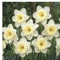
Large-cupped Ice Follies