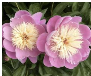
Bowl of Beauty