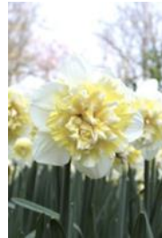
Large-cupped Ice King