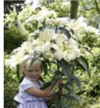
Pretty Woman Orienpet