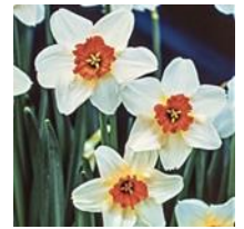
Small-cupped Barrett Browning